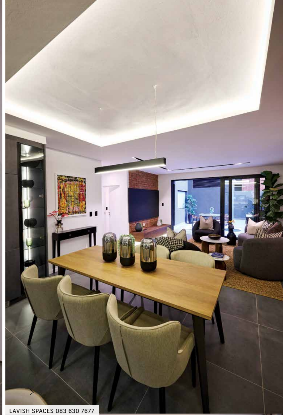
LAVISH SPACES 083 630 7677

ABOVE: Specialising in composite stone sanitaryware, TT Stone provided the high-quality, long-lasting and aesthetically pleasing Octavo and Ovale bathtubs in this home in custom colours. The matt finish in black, grey and white has resulted in a product that is timeless in its looks and backed by durability due to the high-quality materials used. TT Stone's products are engineered specifically to be beautiful, practical and last a lifetime, and they are hygienic and easy to maintain as well. Based in Pretoria, the company services both the local and export markets with excellence.