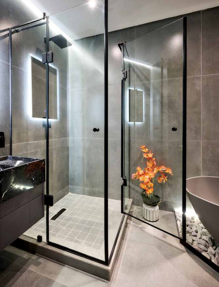
ELEGANT BATHROOM AND SHOWER DESIGN 079 838 9790