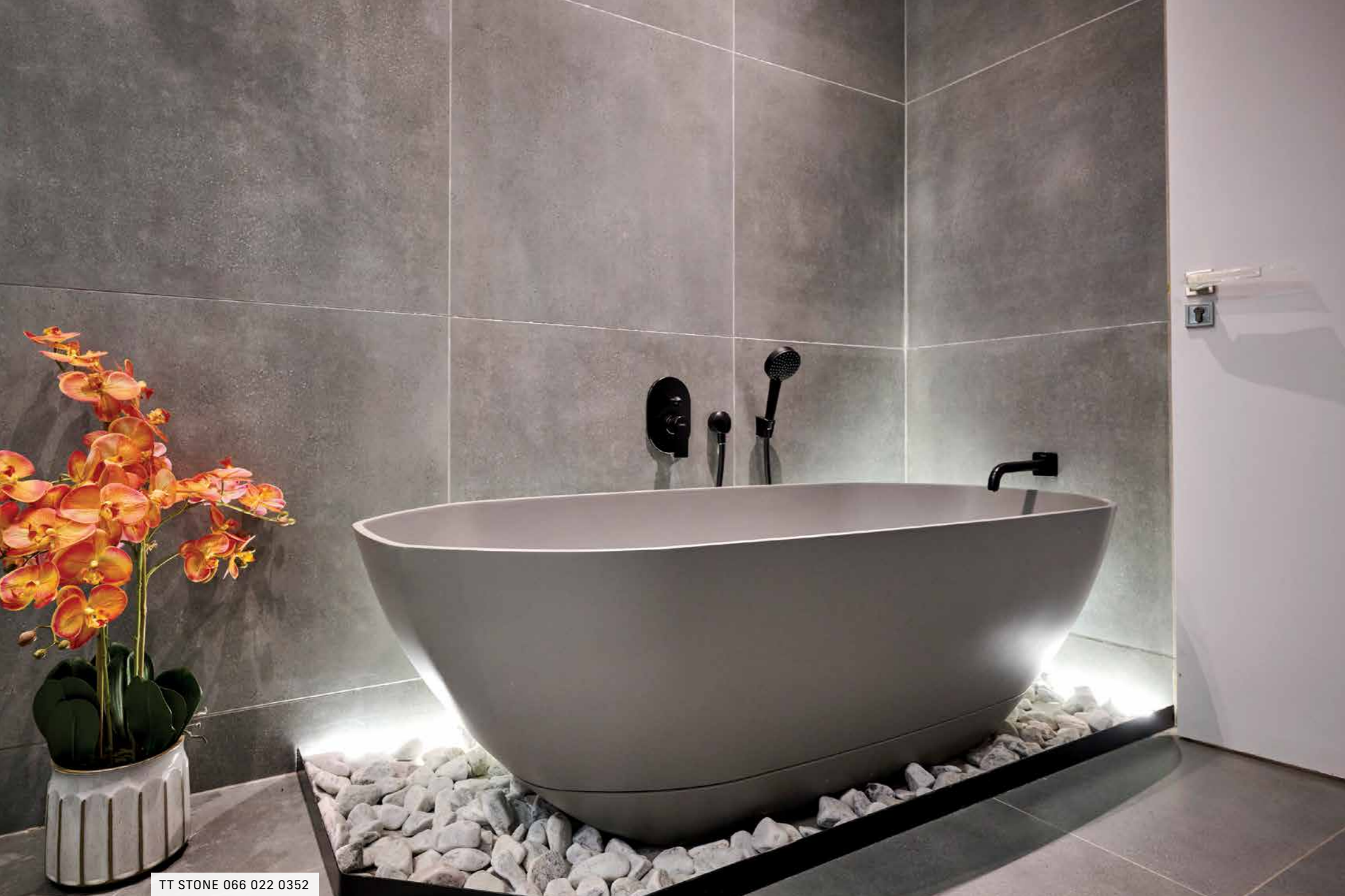
TT STONE 066 022 0352