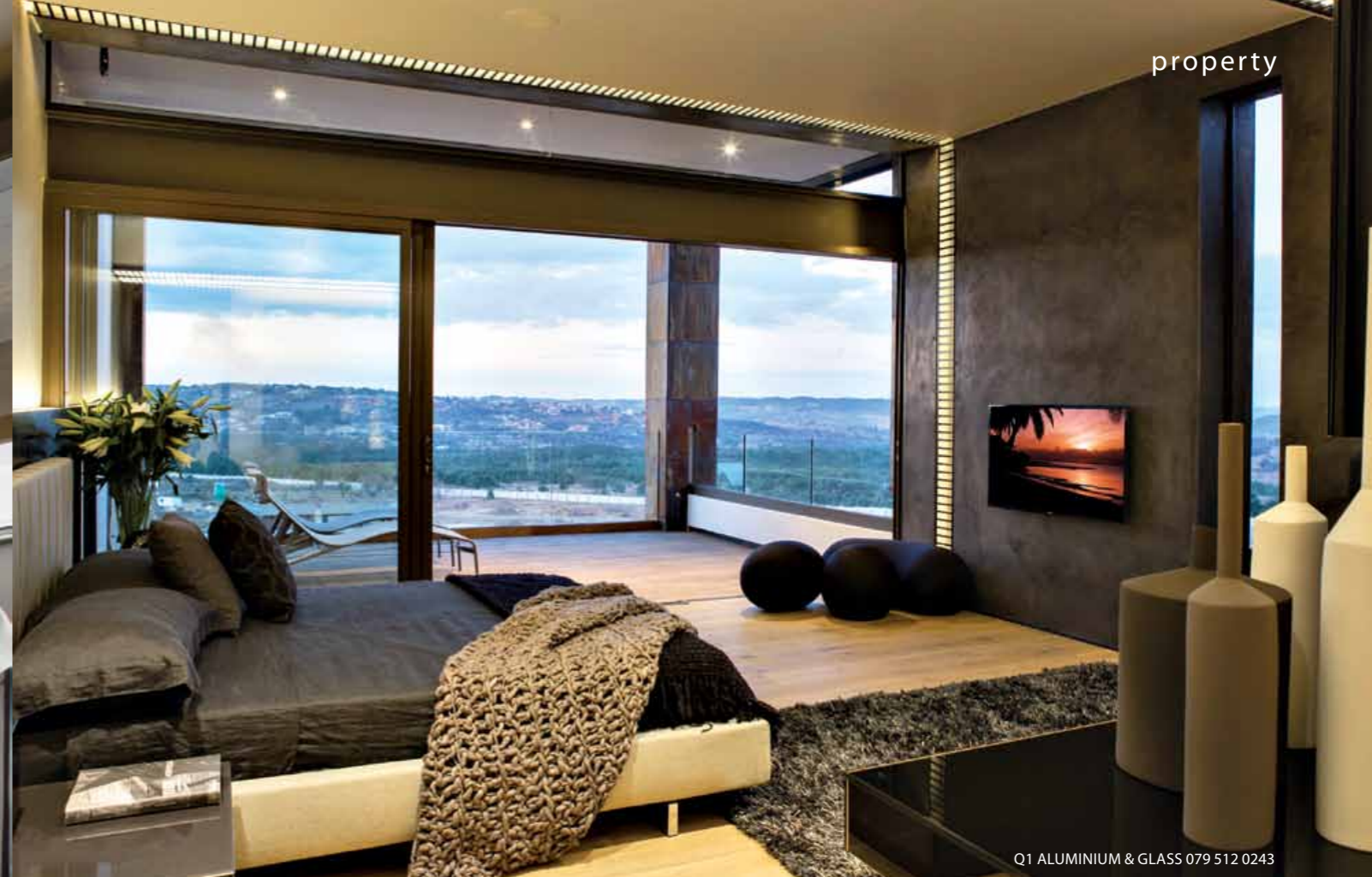
Q1 ALUMINIUM & GLASS 079 512 0243

ABOVE: Q1 Aluminium & Glass specialises in installation of aluminium windows and doors. Striving to give its clients a great product, Q1 Aluminium & Glass offers efficient services in supplying excellent quality that will complement the design of a home, as well as clearly communicating productions and installation dates. In this home, Q1 Aluminium & Glass installed the aluminium windows and doors, as well as provided the stacking frameless glazing doors.