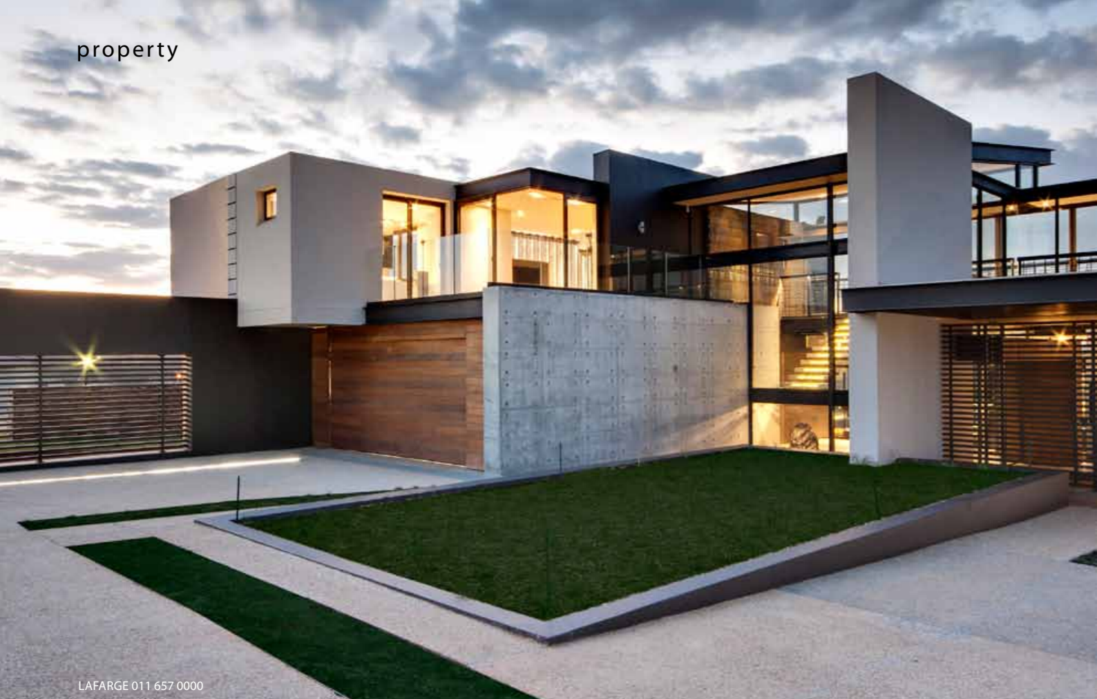
LAFARGE 011 657 0000