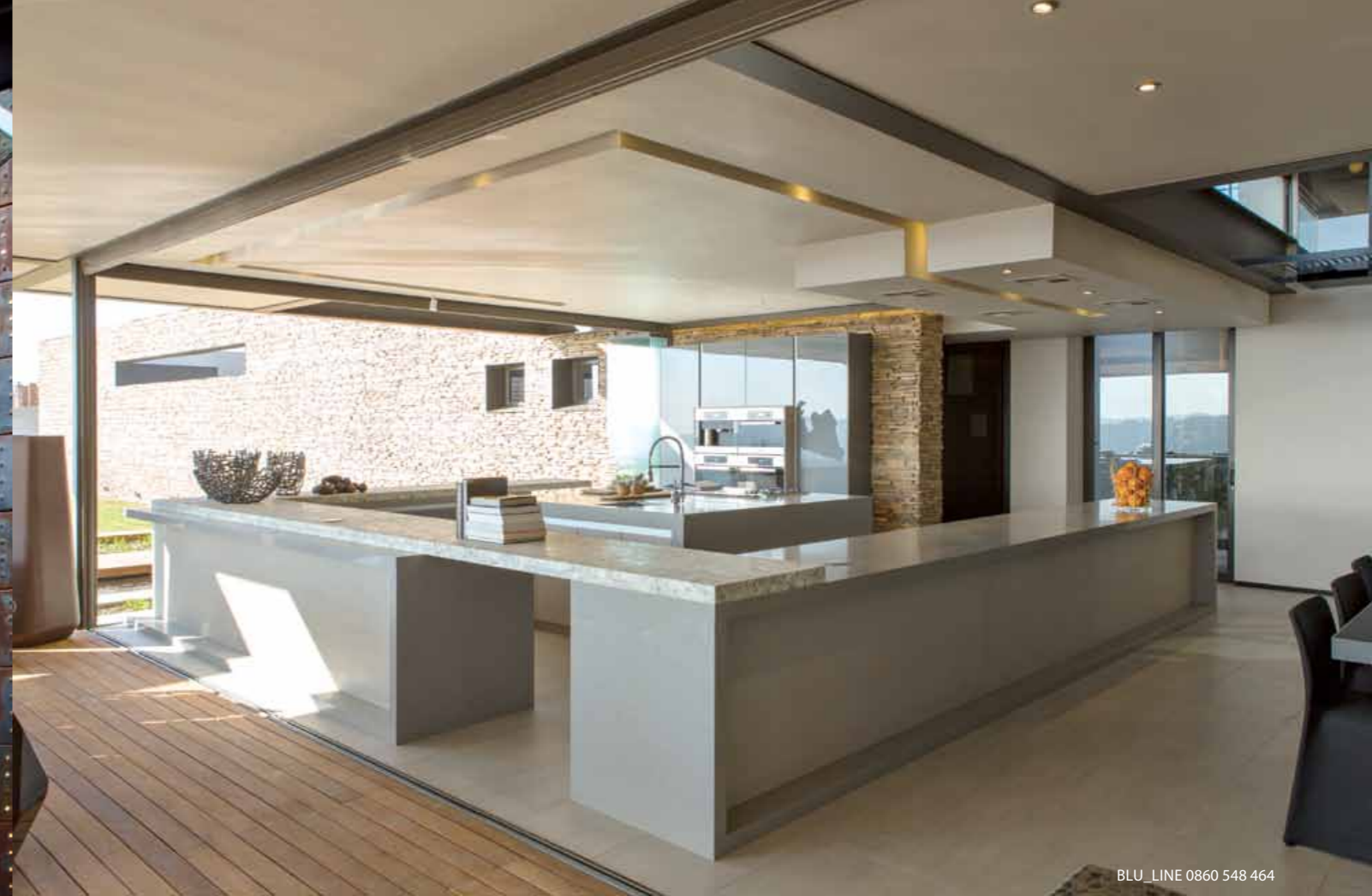
BLU_LINE 0860 548 464

The concrete staircase features steel inlays and relates to the aluminium ceiling, which features in both the main bedroom and living room. The double-volume entrance hall, framed by a perforated skin of scaffolding boards bolted to a wall, creates the perfect backdrop for the sculptural looking staircase.