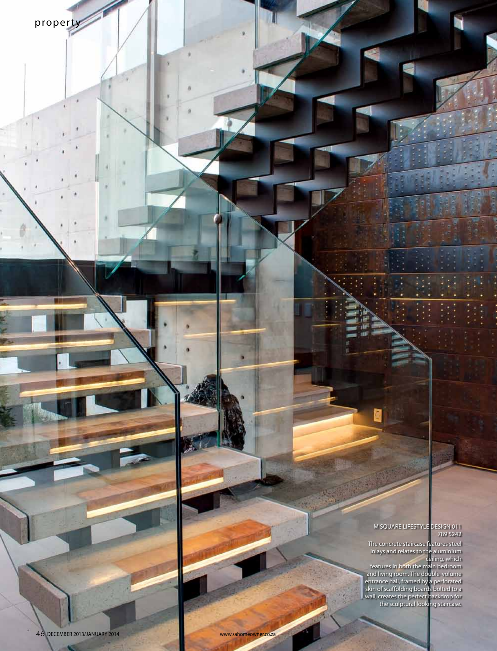
M SQUARE LIFESTYLE DESIGN 011 789 5242

The concrete staircase features steel inlays and relates to the aluminium ceiling, which features in both the main bedroom and living room. The double-volume entrance hall, framed by a perforated skin of scaffolding boards bolted to a wall, creates the perfect backdrop for the sculptural looking staircase.