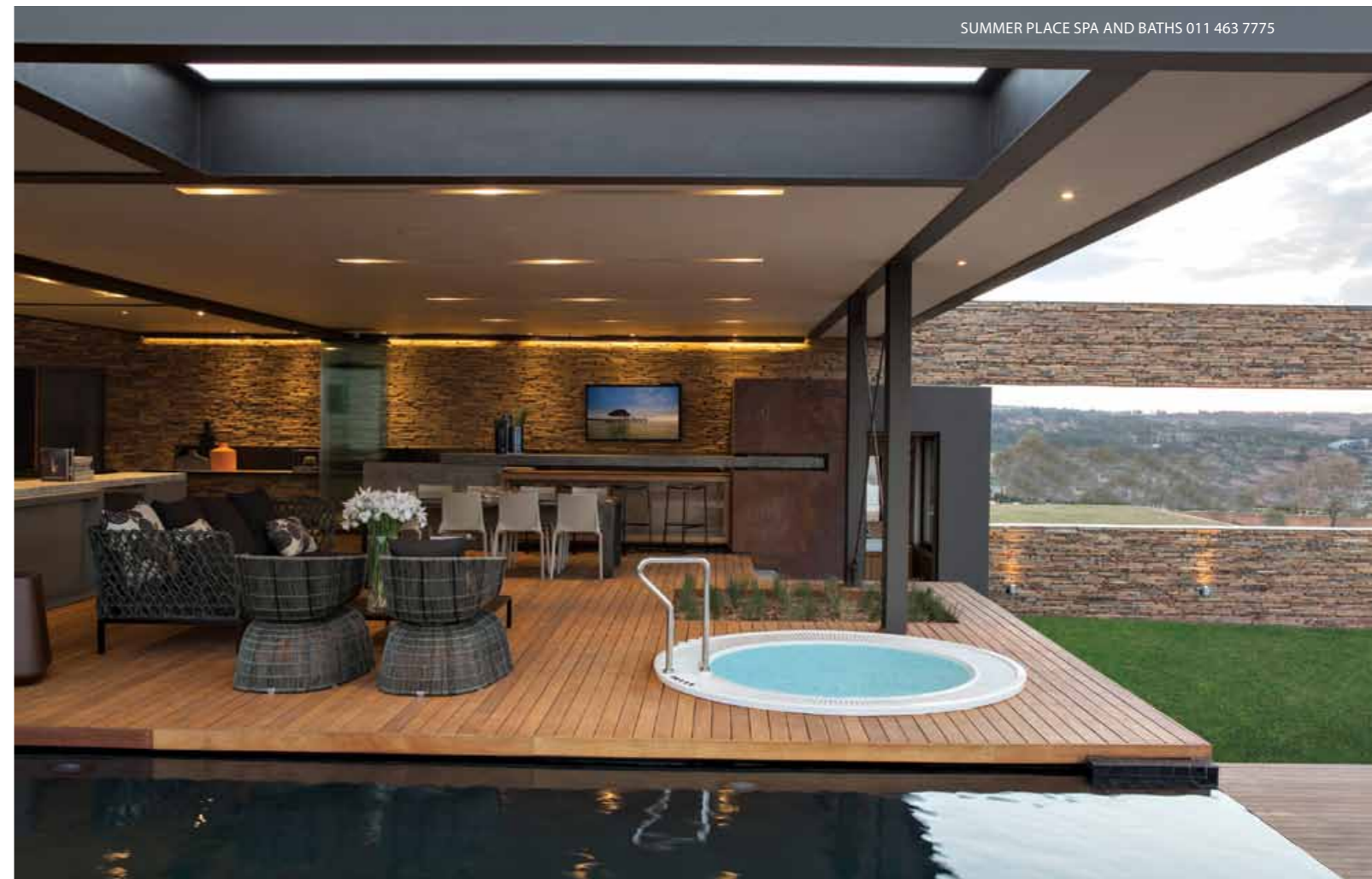
SUMMER PLACE SPA AND BATHS 011 463 7775