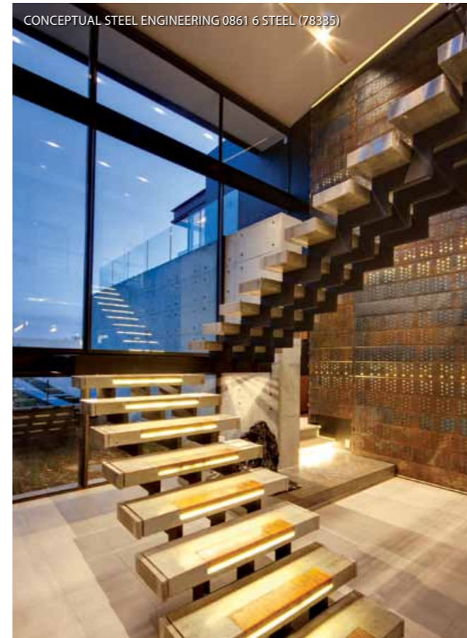
CONCEPTUAL STEEL ENGINEERING 0861 6 STEEL (78335)

and reinforce the bush-lodge concept, which can be noticed in his selection of materials, colours, and the way in which the house has a natural positive flow.